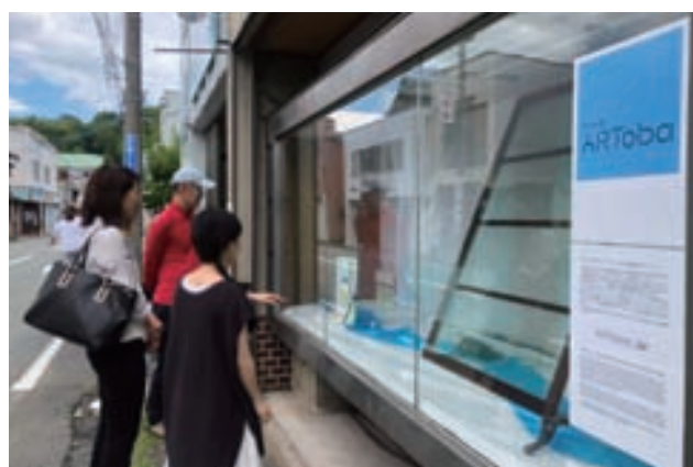
Exhibition Opening Party