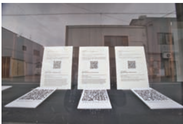
Soundscapes by Yumi MASHIKI