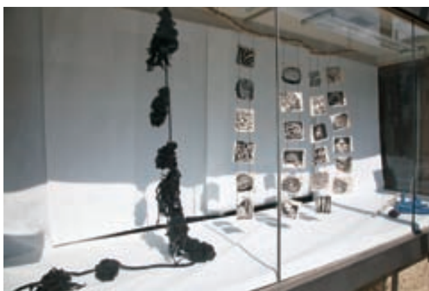
Artwork by Zoe PORTER