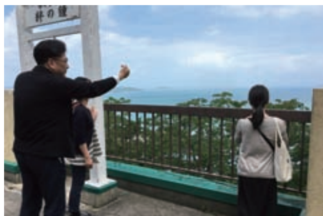
Research in Ijika, Toba