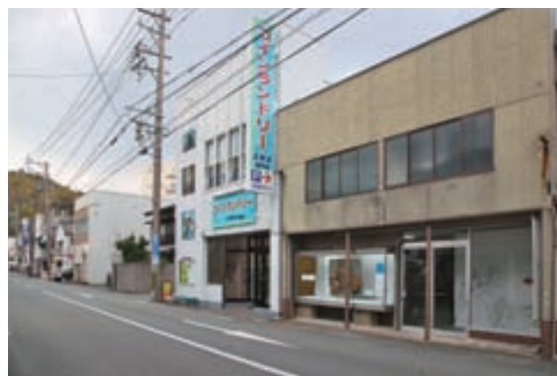
ARToba Window Gallery